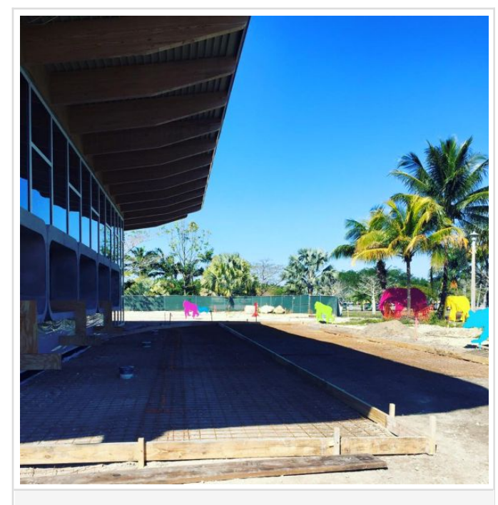
PROJECTS: ZOO MIAMI