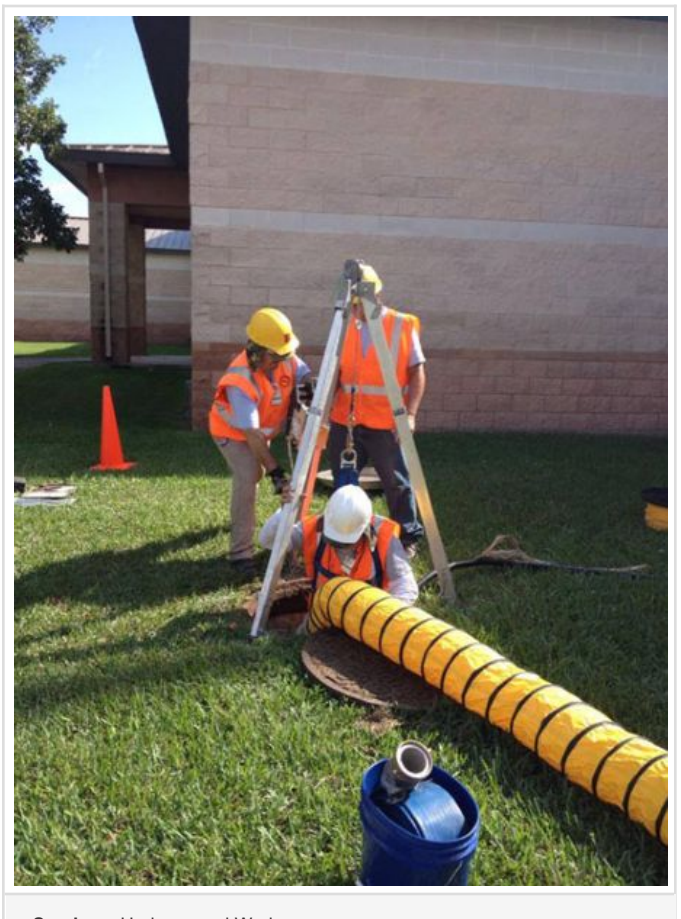
Services: Underground Work